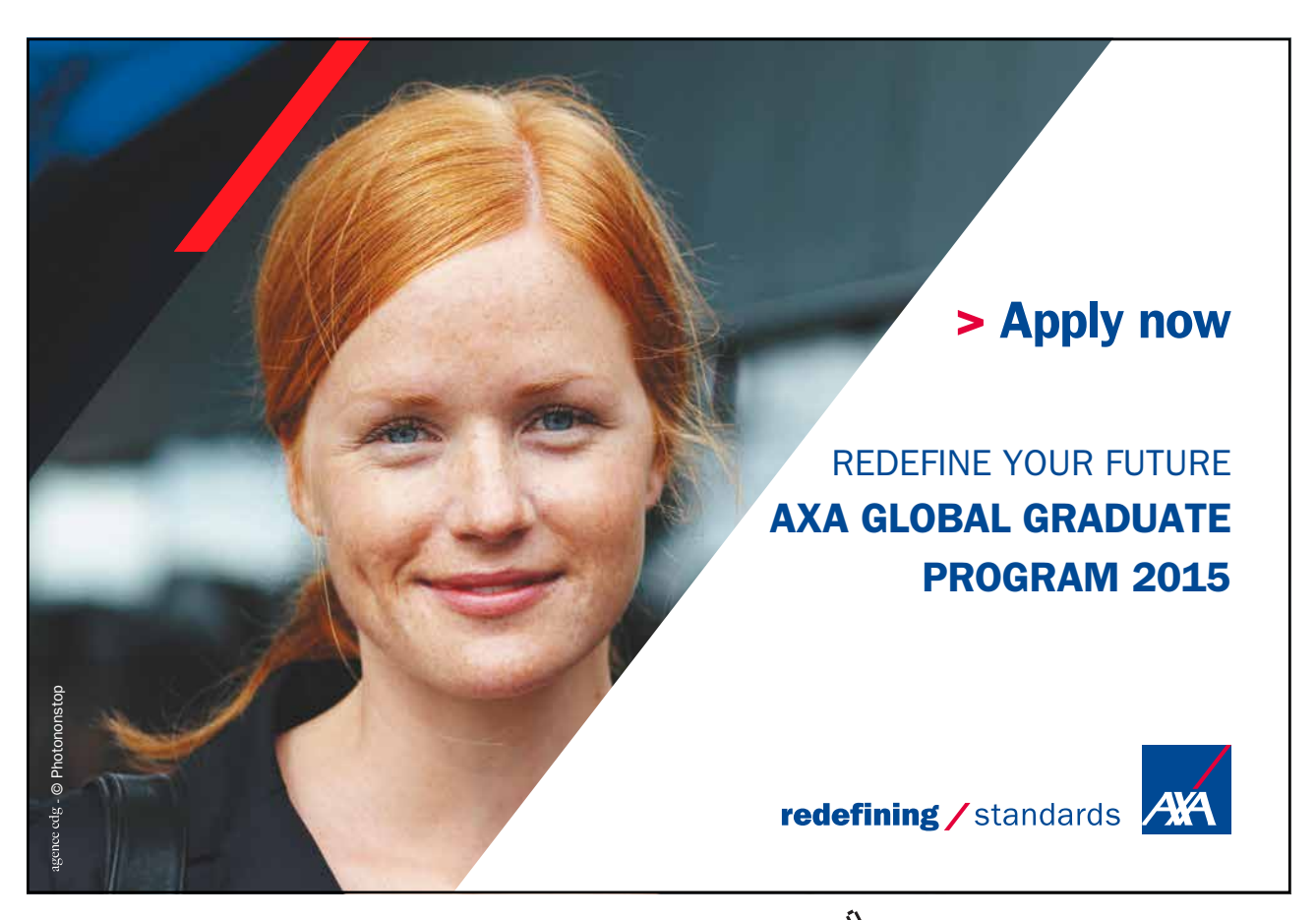
Download free eBooks at bookboon.com

The Internet allows sex offenders instant access to other sex offenders worldwide, forums facilitate open discussion of their sexual desires, shared ideas about ways to lure victims, mutual support of their adult-child sex philosophies, instant access to potential child victims worldwide, disguised identities for approaching children, even to the point of presenting as a member of teen groups. Furthermore, the Internet allows potential offenders ready access to chat areas and social networking sites reserved for teenagers and children, to discover how to approach and who to target as potential victims. The Internet provides a means to identify and track down home contact information, and the Internet enables adults to build long-term virtual relationships with potential victims, prior to attempting to engage the child in physical contact.